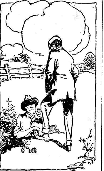
"That's the Real Stuff!"

Where should he go for comfort save to her? It was his privilege, his