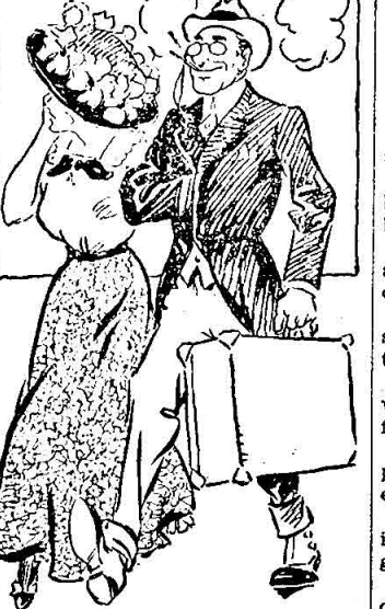
Walked as Though He Trod on Air.

Markham and he were not on friendly terms. He knew enough of