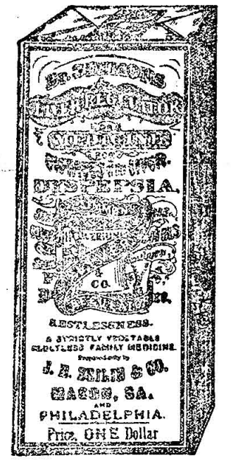
Remember There is no other genuine Simmons Liver Regulator.